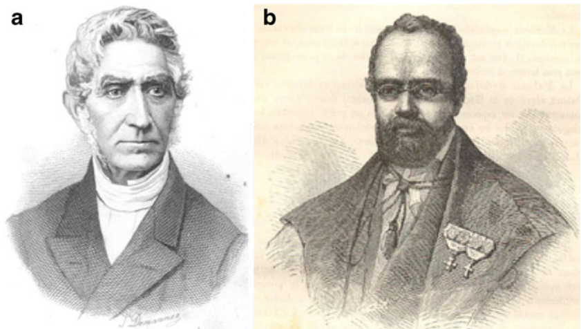
Fig. 1 a Adolphe Quetelet (1796–1874), Director of the Observatory of Brussels and founder of the international network of “Observations of the periodical phenomena”. b Charles Morren (1807–1858), Professor of Botany at the University of Liège and father of “Phenology”

An overview of the observations on periodical phenomena was published as chapter IV of the book Sur le Climat de la Belgique (Quetelet 1849). This book contains a note on the Instructions pour l'observation des phénomènes périodiques concerning plants (Quetelet 1849, pp. 174–183). Later, a third set, dated 25 April 1853, was printed as